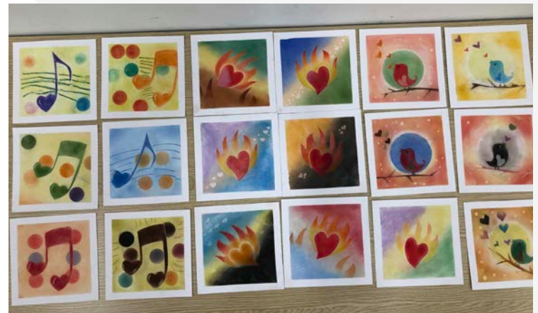
The artworks done by the residents of Thye Hua Kwan Nursing Home @ Hougang, displayed at the Nagomi Art Exhibition

A key event would be the Nagomi Art Exhibition held in November 2019, where the Nagomi Art pieces created by the residents of Thye Hua Kwan Nursing Home @ Hougang were on public display. Sales from the proceeds were given to Thye Hua Kwan Nursing Home @ Hougang.