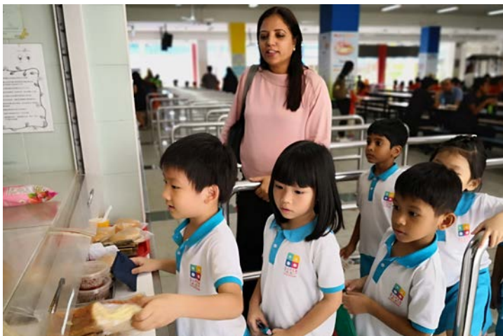
Super Talent Childcare (Ang Mo Kio) children queueing up at Teck Ghee Primary School canteen to buy lunch