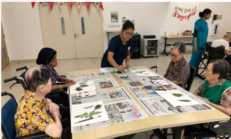
Thye Hua Kwan Nursing Home @ Hougang staff guiding the seniors during the Sensory Art sessions

Sensory Art sessions were held on every Monday, and are led by therapy aides and healthcare assistants. 3 residents from each ward attend these weekly sessions and new residents will be selected to join every quarterly.