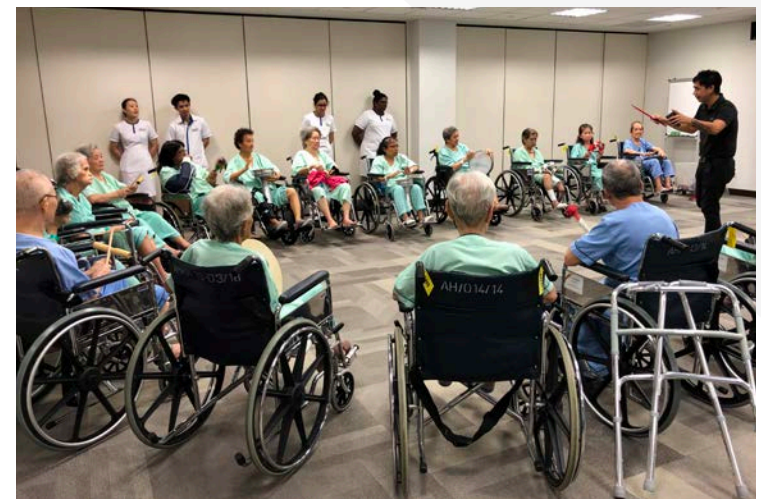
Patients gathered in a circle playing percussion instruments under the guidance of the trainer and his assistant

Patients are involved in playing percussion instruments like Bass Drums, Hand Drums and Hand Percussion (Tambourines, Shakers, Hand Bells, Triangle etc). Playing such instruments helps patients to reduce tension, anxiety, depression, stress and improve their joint mobility, posture and motor skills. Patients are guided by the trainer and his assistant, and the volunteers distribute the instruments to the patients and encourage the interaction between patients.