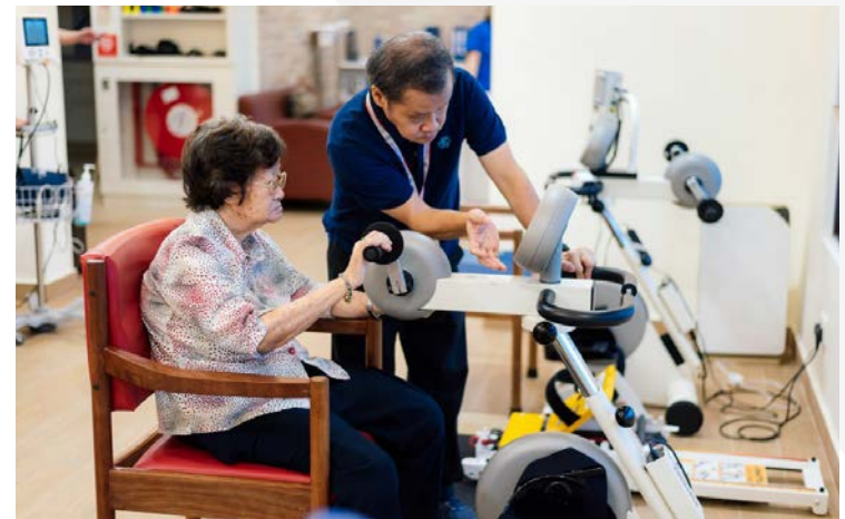
Senior doing some simple exercises at THK Senior Care Centre @ Kaki Bukit

The Day Rehabilitation Centre serves clients who require rehabilitation and therapy to improve their functional status to the maximum possible level. This is done through sessions with our physiotherapists and occupational therapists who will help to maintain the clients' physical and mental function, as well as empower them to stay independent and active in the community. The centre also offer evening therapy sessions to allow family members to bring clients in for therapy after working hours.