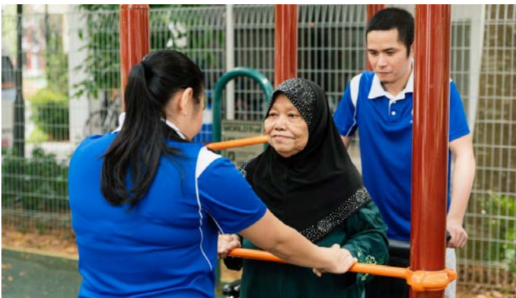
THKNH staff members assisting the client with her workout