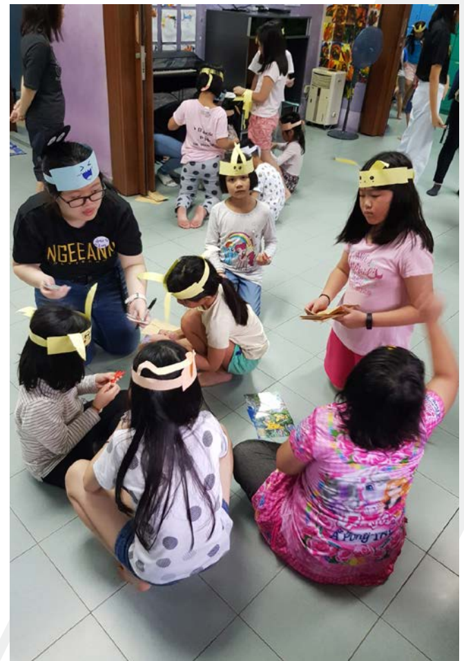
Super Talent Student Care Centres children wearing their handmade paper headbands