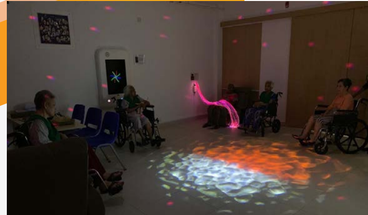
Residents receiving therapy in the spacious sensory room