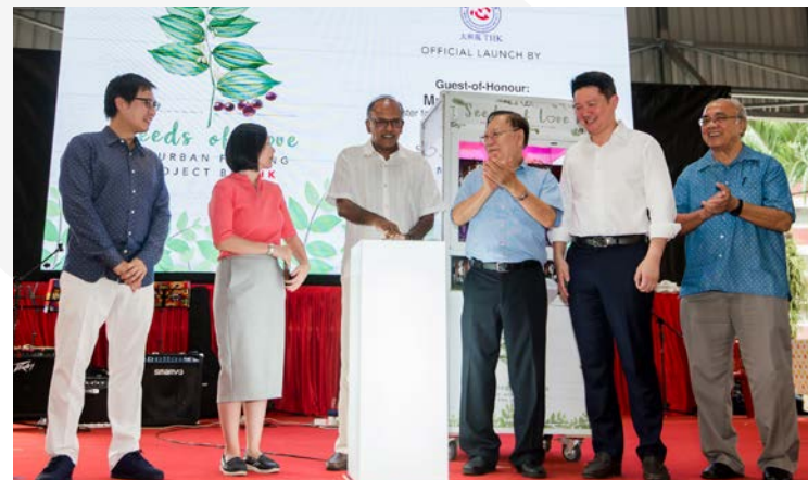
Minister for Home Affairs and Minister for Law Mr K Shanmugam launched the "Seeds of Love", a new urban farming initiative

The 'Seeds of Love' initiative was piloted at THK Chong Pang Social Service Hub, THK Social Service Hub @ Bukit Batok East, THK Seniors Services @ Taman Jurong and THK Young at Heart.