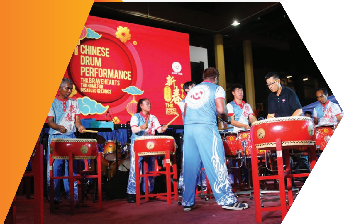
The talented residents from THK Home for Disabled @ Eunodos, known as the THK Bravehearts, sprang the THK Spring Festival 2019 with a roaring Chinese drum performance