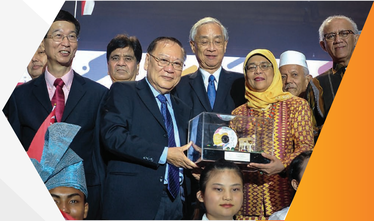
The grand finale at Inter Racial Inter Religious Harmony Nite 2019