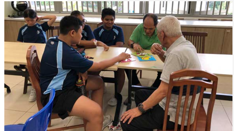
Students from Xinmin Secondary School interacting with the residents at Thye Hua Kwan Nursing Home @ Hougang

Under the Ministry of Social and Family Development SG Cares initiative, secondary one students from Xinmin Secondary School befriended the residents for 9 months in 2019.