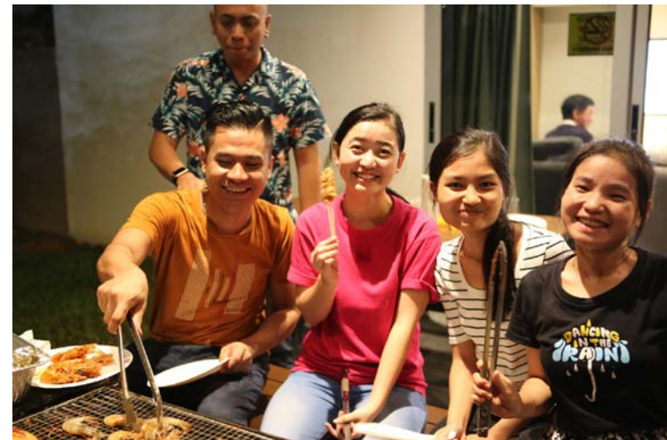
THK Moral Welfare Home staff having fun while grilling their food at a barbeque party at the Junior Staff Retreat 2019

Be Kind SG Christ Grace Church Football Association of Singapore Gardens by the Bay Mahaprajna Buddhist Association NUS Volunteer Action Committee People’s Association Project Dignity Pu Ti Buddhist Temple Silat Road Sikh Temple The Esplanade Zhi Zhen Tan Dao Xue Charity