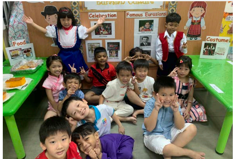
Children of Super Talent Childcare (Ang Mo Kio) in different ethnic costumes at the annual Racial Harmony Day Celebration

Super Talent Childcare Limited continues to strive for quality care and education for young children, from 2 months to 6 years old, as the childcare reaches its fourth year as an appointed Partner Operator (POP) under the Early Childhood Development Agency's (ECDA) POP Scheme. While the leaders and teachers participate in various projects with community partners and families, the centres were also renovated to keep up with a new and modern learning environment.