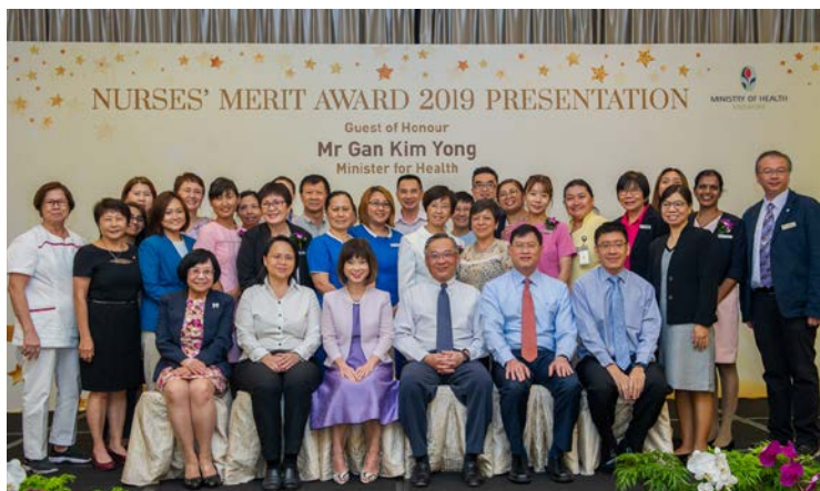
Nurses from Ang Mo Kio-Thye Hua Kwan Hospital taking a group photo with Guest-of-Honour, Minister for Health Mr Gan Kim Yong and Senior Minister of State for Ministry of Health & Ministry of Environment and Water Resources Dr Amy Khor

The Nurses' Merit Award is given by the Ministry of Health to nurses who have demonstrated consistent and outstanding performances for the past three years, had professional development, and made contributions to promote the nursing profession.