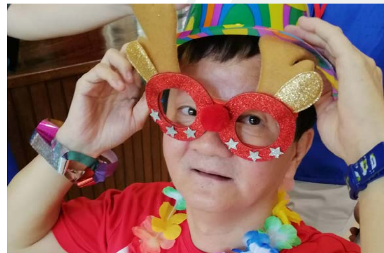
A resident dressed up for the ‘Be Kind SG Concert & Magic Show’ at THK Moral Welfare Home