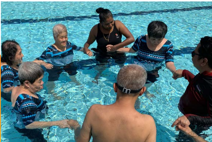
Residents of THK Moral Welfare Home undergoing Aqua Therapy

THK Moral Welfare Home revisited the "Aqua Therapy", a therapy programme utilised in the previous years. The Aqua Therapy sessions are specially designed for residents who suffer from musculoskeletal disorder (MSDs). Over the course of 10 weeks, participants had improvements in flexibility, balance, coordination and muscle endurance.