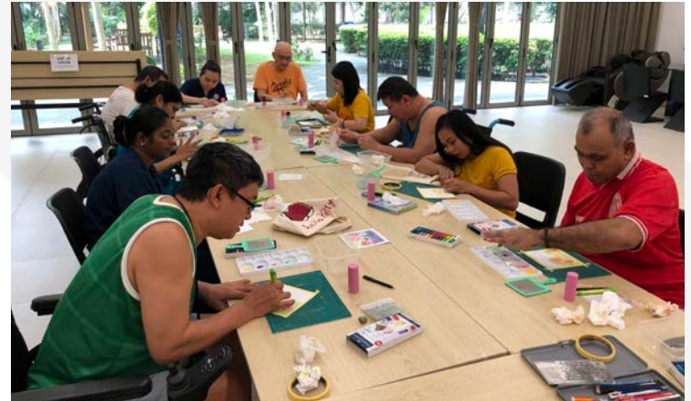
Residents creating beautiful art pieces during the Nagomi Pastel Art workshop

Nagomi Pastel Art Workshop was piloted on 20 August 2019 and is currently conducted by a therapy aide and 3 nurses who are trained. This workshop is for residents in the wards, especially those bed bound residents who need to develop their hand and fingers motor skills.