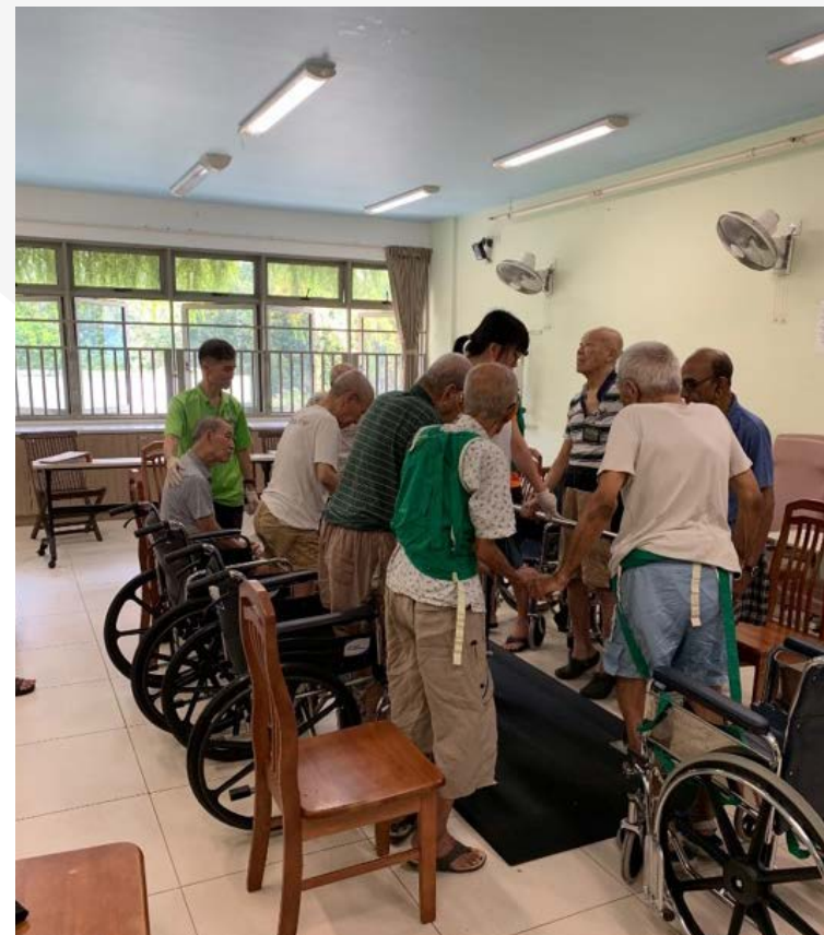
Seniors engaging in a group exercise session

Exercise Corner Programme was implemented in February 2019, where the therapists engaged dementia residents with individual and group exercise sessions. They also put in place a Falls Prevention Programme where baseline data are collected and outcome measures are reviewed every six months.