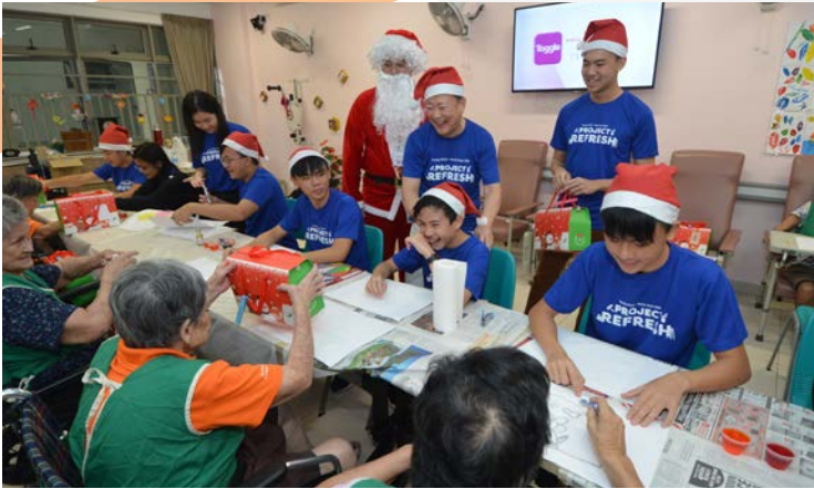
The volunteers did the Christmas crafts together with the residents