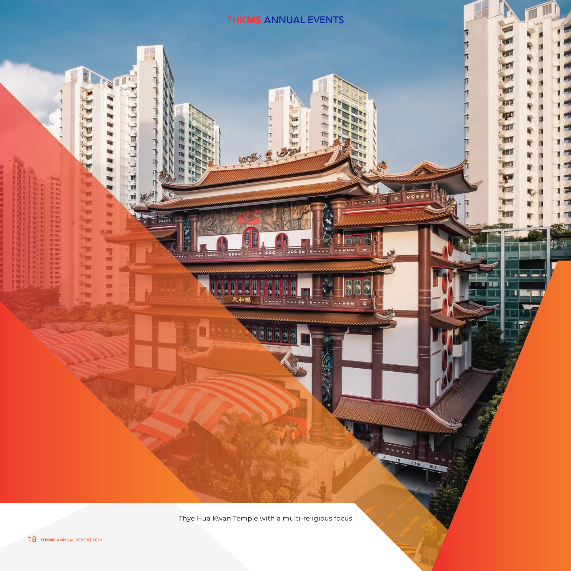
Thye Hua Kwan Temple with a multi-religious focus