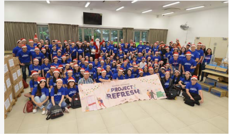
Project Refresh volunteers posing for a group photo

Thye Hua Kwan Nursing Home @ Hougang collaborated with North East Community Development Council (CDC), National Trades Union Congress' youth wing (Young NTUC) and Bedok Reservoir - Punggol Citizens' Consultative Committee (BRP CCC) for Project Refresh. As part of Project Refresh, the volunteers visited the residents of Thye Hua Kwan Nursing Home @ Hougang on 14 December 2019 to spread the Christmas festive cheer. Crafts and decoration props made together by the volunteers and residents were used to decorate the place. Member of Parliament for Tampines GRC and Mayor of North East District Mr Desmond Choo and Adviser to Aljunied GRC Grassroots Organisations Mr Victor Lye were also invited to join the festive celebration at the Nursing Home.