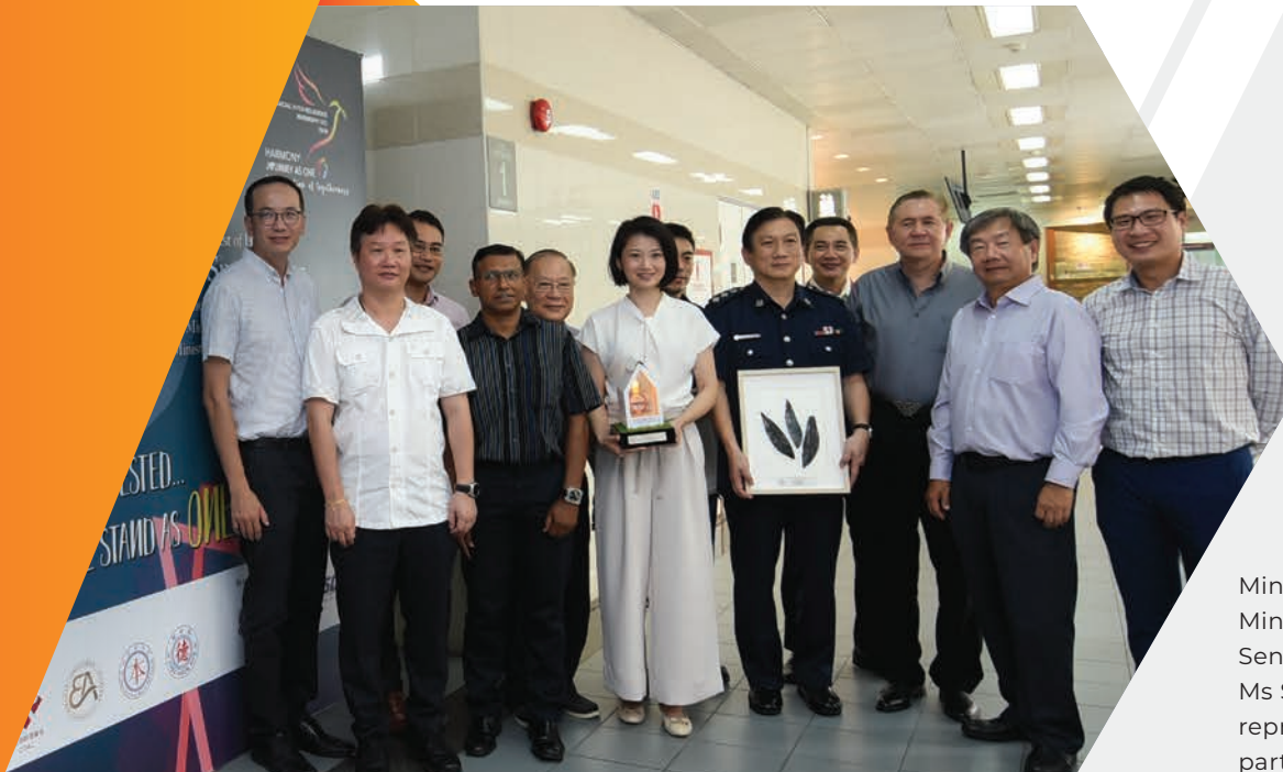
Ministry of Home Affairs and Ministry of National Development, Senior Parliamentary Secretary Ms Sun Xueling with THK representatives and organising partners of the Harmony Drill

Singapore's Ground Response Force (GRF) is known to be alert to deal with a domestic terror, but are the people ready? A counter-terrorism exercise was simulated at the Ang Mo Kio-Thye Hua Kwan Hospital on 26 June 2019 as a timely and solemn reminder in the wake of terror attacks happening around the world. Ministry of Home Affairs and Ministry of National Development, Senior Parliamentary Secretary Ms Sun Xueling was present to observe the exercise. Codenamed "Heartbeat", the simulation was jointly organised by Thye Hua Kwan Moral Society and the Singapore Police Force, supported by the Singapore Civil Defence Force.