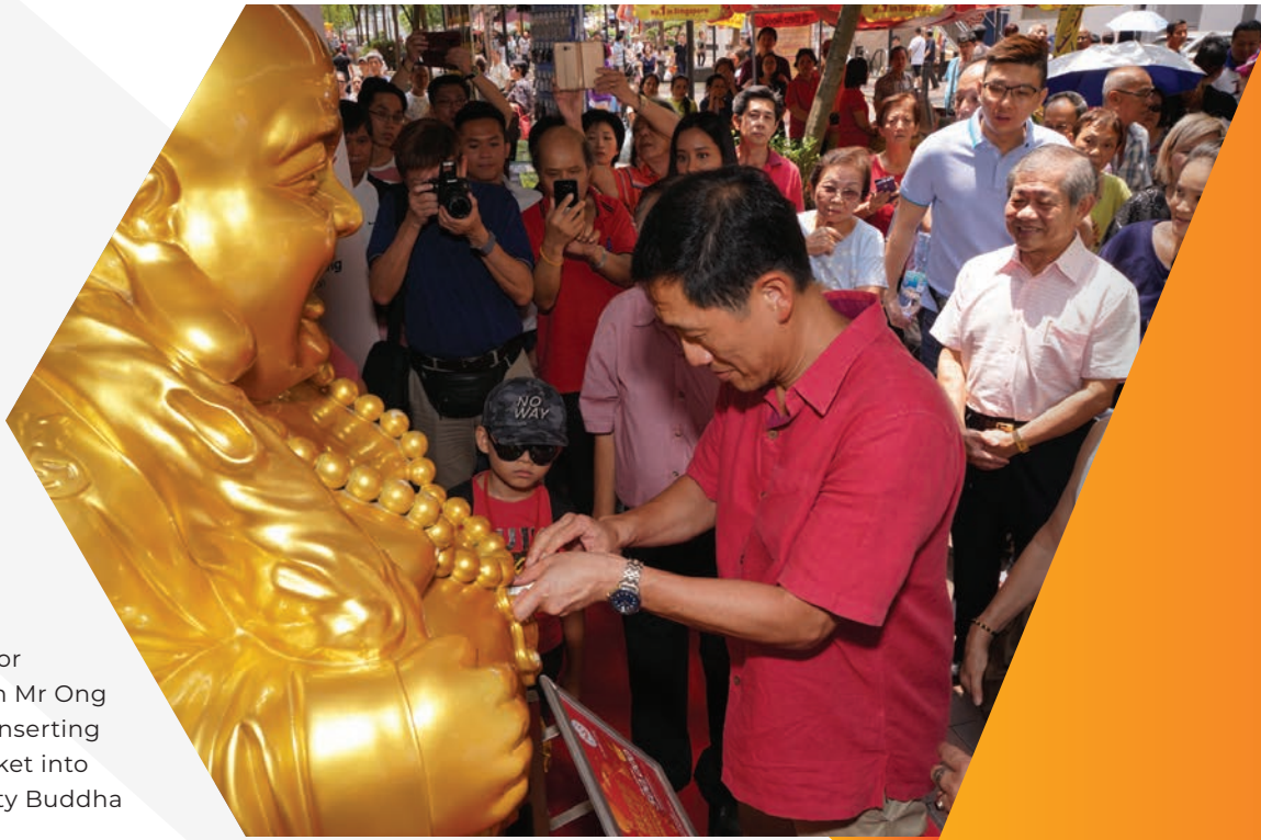
Minister for Education Mr Ong Ye Kung inserting a red packet into the Charity Buddha statue