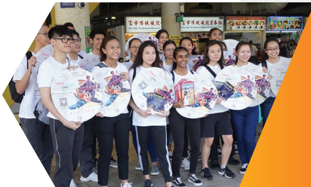
Volunteers from Republic Polytechnic getting ready to paste the table top stickers at Marsiling Mall Hawker Centre