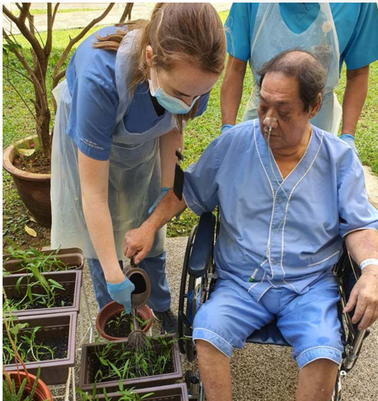
A staff from Ang Mo Kio-Thye Hua Kwan Hospital assisting a patient to water his plants

During this programme, patients plant the 'kang kong' seeds which are expected to be ready for harvest in a month. To do so, they have to loosen the soil, remove weeds and water the plants with the help from volunteers at times. Volunteers also assist to wheel the patients around the garden to catch some fresh air. Through this activity, patients are able to bond with the volunteers.