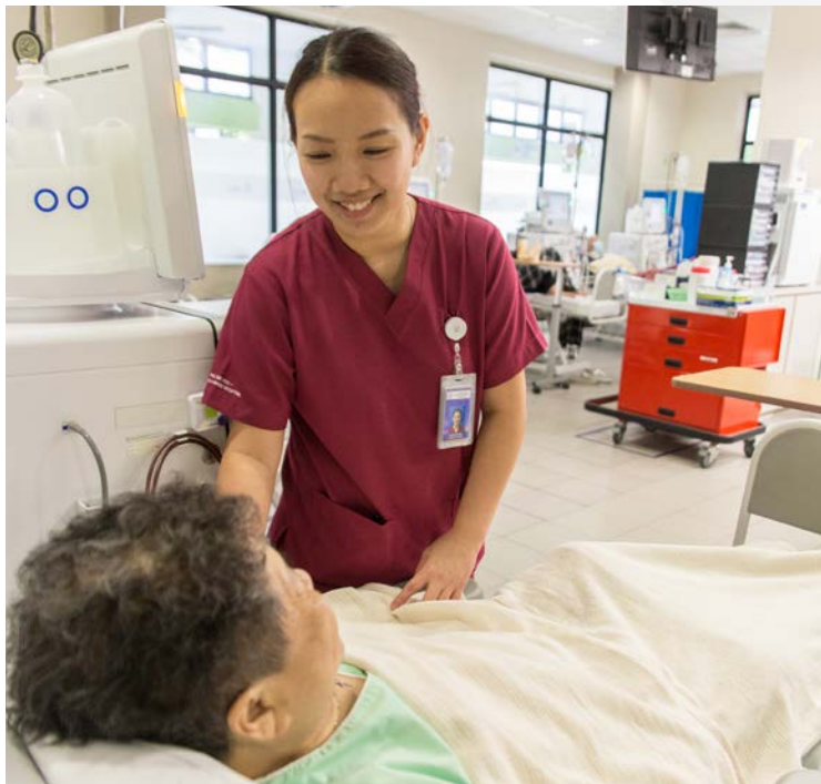
Ang Mo Kio-Thye Hua Kwan Hospital nurse attending to a patient

Ang Mo Kio-Thye Hua Kwan Hospital is a 370 bedded community hospital that offers rehabilitative and sub-acute care. It offers a customised care plan for every patient, to help them regain independence and mobility, so as to integrate them back into the community. Ang Mo Kio-Thye Hua Kwan Hospital had a total of 3,182 patients in 2019.