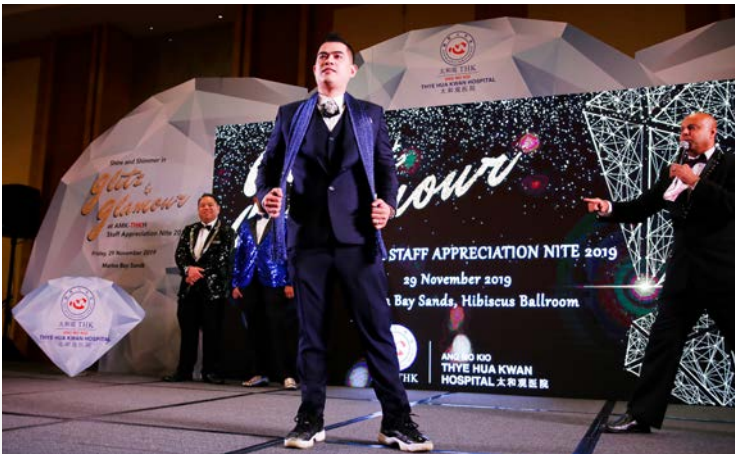
THK staff nominated for the "Best Dressed Award" showcasing his outfit for the night