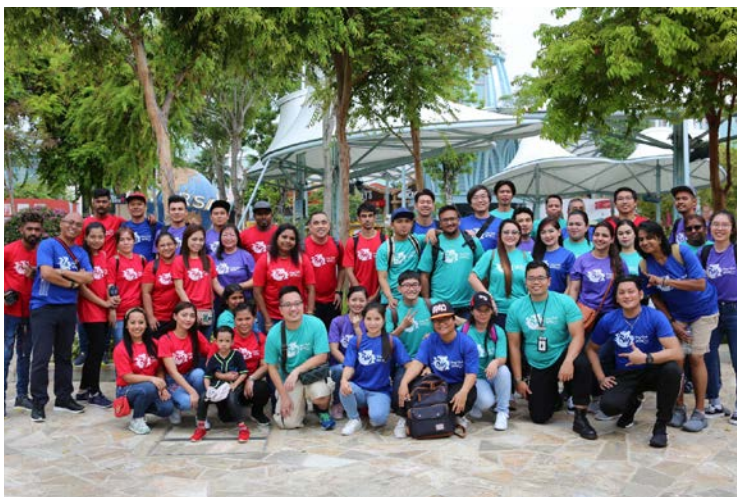
THK Moral Welfare Home staff and residents, together with volunteers from James Cook University at S.E.A Aquarium for Big Day Out 5