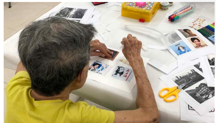
Senior creating a scrapbook during the 'Life Review' art session

The nursing home also engaged the students to train our staff in 'Life Review' and structured it into a programme to help them better understand the seniors' life journey prior to nursing home admission, enabling ourselves to provide better person-centred care.