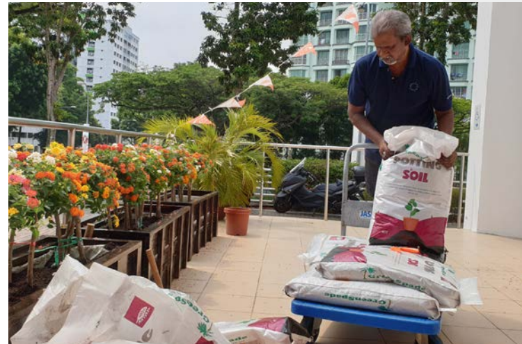
A staff rejuvenating the garden soil at THK Angsana Home @ Pelangi Village

The Home strives to meet the provocations of the fast-evolving and ever-changing social and technical landscape to constantly provide better and more efficient services to the residents. As the Home embarks onto the final stage of the 3-phase strategic plan known as “Angsana Future Ready” in 2020, the Home has initiated the Angsana Residents Movement System, an electronic system to track and account for the movement of residents with a supplementary section for staff attendance, along with the SoundEye.