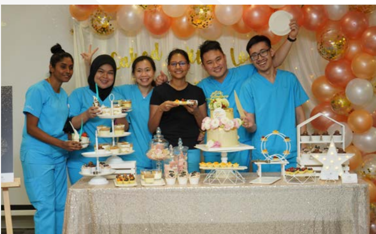
Ang Mo Kio-Thye Hua Kwan Hospital nurses on shift at the carnival