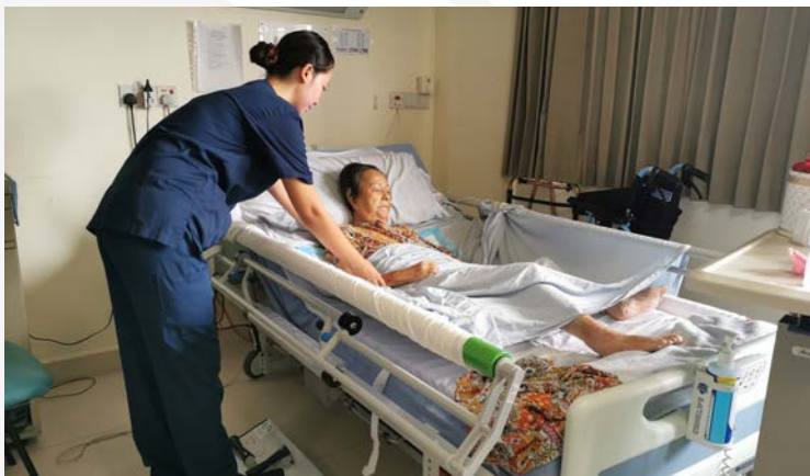
Thye Hua Kwan Nursing Home @ Hougang nurse using TurnAid to readjust the resident's position to make her feel more comfortable

Regular bed turning throughout the day can be very time consuming and taxing on the care staff, especially when assisting heavier clients. TurnAid, an automated repositioning system, has eased the manual work of the staff while improving workplace safety and care quality for the clients.