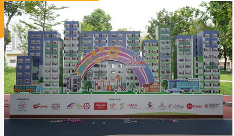
A 3D miniature structure representing the Boon Lay community filled with photos of residents taken at the THK Family SMILES Carnival