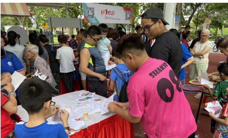
Residents participating in the activities at the various booths

THKMC was appointed by the Ministry of Culture, Community and Youth (MCCY) to operate the SG Cares Volunteer Centre @ Boon Lay to strengthen the spirit of volunteerism in the Boon Lay community. Special thanks to our sponsors - National Dental Centre Singapore (NDCS), Satoyu Trading Pte Ltd, and Colgate.