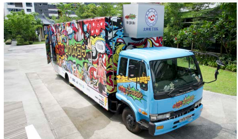
THK Family Services Division's youth-themed truck showcased a series of youth programmes during the month of July in 2019