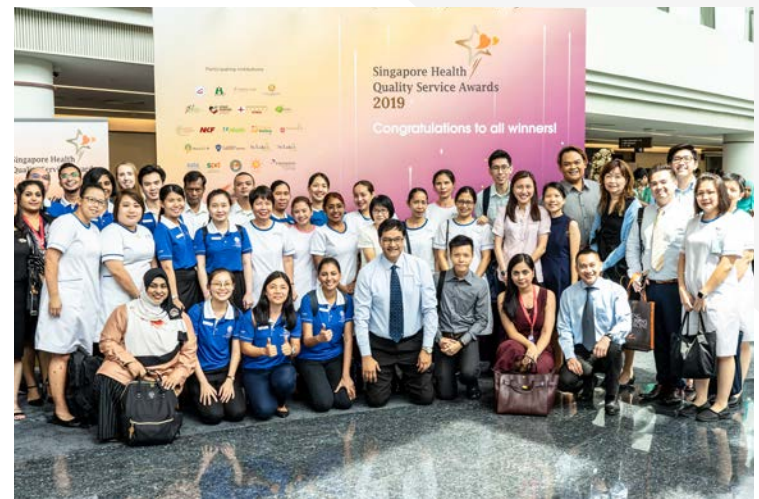
Staff from Ang Mo Kio-Thye Hua Kwan Hospital taking a group photo at the Singapore Health Quality Service Awards 2019

On 18 September 2019, 11 recipients from Ang Mo Kio-Thye Hua Kwan Hospital received the award from Guest-of-Honour, Senior Minister of State for Ministry of Health & Ministry of Environment and Water Resources Dr Amy Khor. These awards provide the recipients with opportunities to upgrade their skills and further develop their career in the Community Care sector.