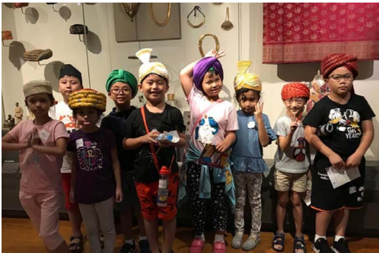
Children from Super Talent Student Care Centre (Bukit Panjang) trying on traditional turbans at the Indian Heritage Centre

Several school trips to educational exhibitions at the various museums in Singapore such as All Hands on Deck! @ Malay Heritage Centre, Little Adventures @ India Heritage Centre and An Afternoon with Friends @ Synmh & Balestier Heritage Trail. During the June and December school holidays, the children enjoyed their time making simple 'do-it-yourself' crafts such as festive cards, handmade soaps and pencil cases at Super Talent Student Care Centre (Punggol Walk).