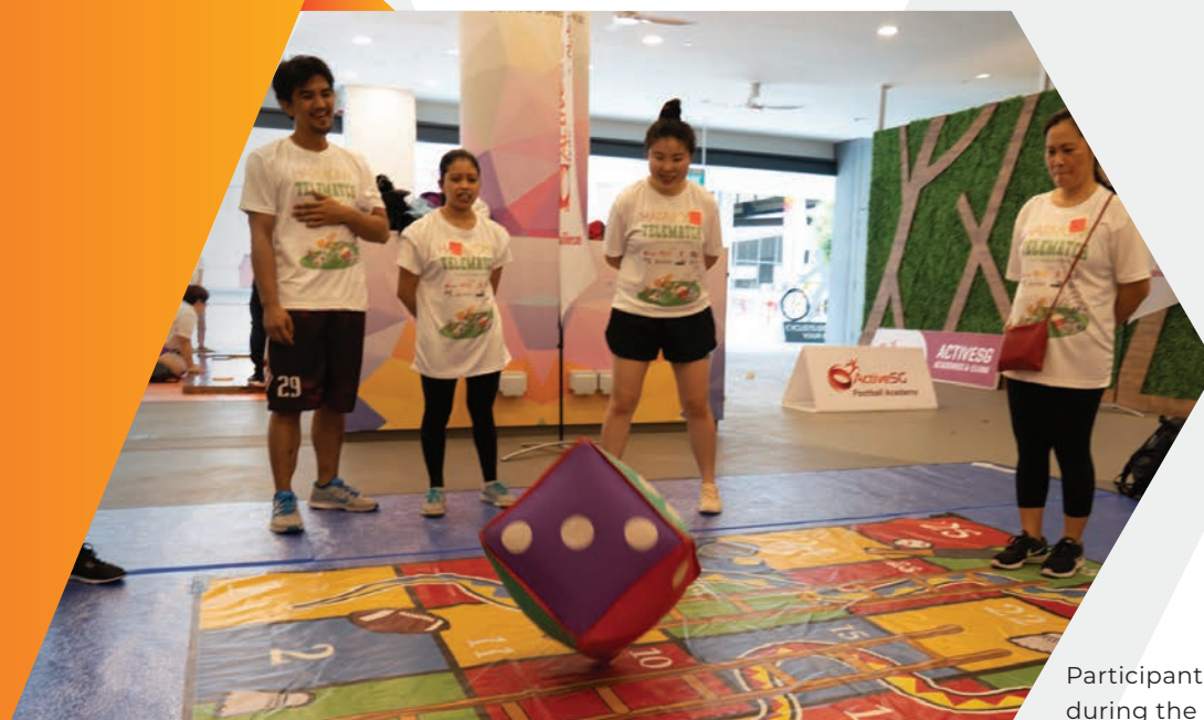
Participants playing Snakes and Ladders during the Harmony Telematch

Play, bond and unite - Individuals of different races and religions came together for traditional and old-school games. On 30 June 2019, 40 teams of 4 gathered at Our Tampines Hub for a friendly competition. The winning team even received $1,000 worth of PUMA vouchers!