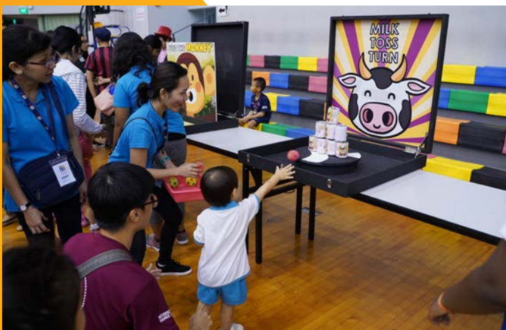
A child attempting to knock the condense milk cans at the "Milk Toss Turn" game booth