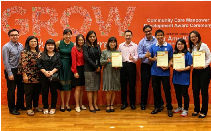
11 recipients from Ang Mo Kio-Thye Hua Kwan Hospital received the Community Care Manpower Development Award

Ang Mo Kio-Thye Hua Kwan Hospital bagged a total of 139 Silver, 96 Gold, 62 Star, 1 Superstar Finalist and 1 Superstar awards.