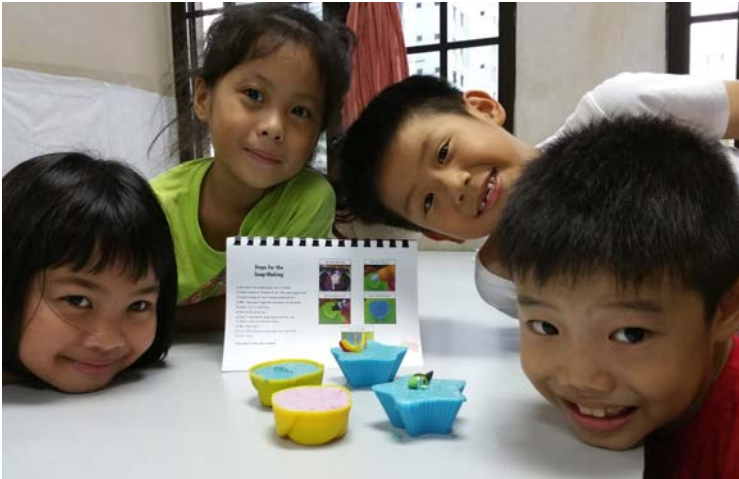
Children posing with their handmade soaps at Super Talent Student Care Centre (Punggol Walk)